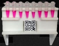
MDBio Automated Analysis Station