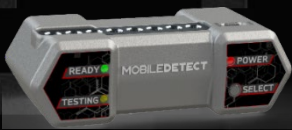
MDBio Thermal Heater